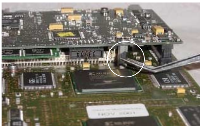
Figure 3: Remove the jumper.